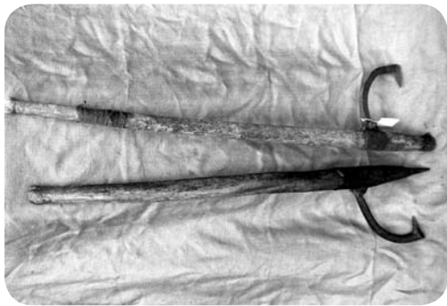
The cant hook and the peavey

This issue, we are featuring two artifacts from our lumbering tools collection: the cant hook and the peavey. These two are often confused, because they not only look similar, but are used in similar ways. Their differences are evident in the photo.