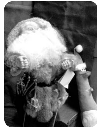
Two Northwest Santas – The beautiful Washington State Santa, on the left, carries salmon and apples and stands with one foot in Western Washington and one in Eastern Washington. The silly Santa to the right is a large clam from the Pacific Northwest called the Goody Duck wearing a little Santa hat.

The large collection soon became famous and people would drive from all around for a special tour from "the Santa Lady." The collection was even featured in several KOMO news stories and on the nationally syndicated TV program "Real People."