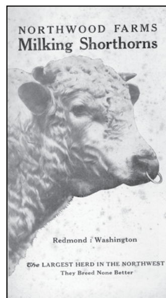
Above: Pamphlet from Northwood Farms, circa 1925.

Terry Dill - A photograph of the Twin Valley Dairy Farm in 1948