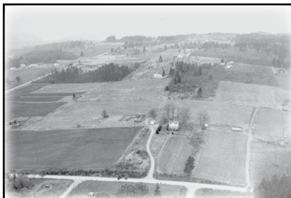
Downey Farm, site of present-day Vuecrest in Bellevue, 1930 and 2007. Looking north-west, with NE 8th St. in foreground, 92nd Ave top left.