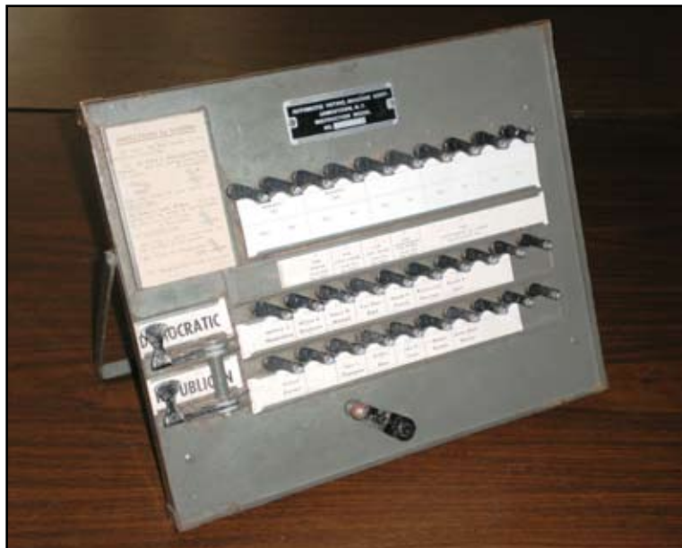
Mechanical Lever Voting Machine, circa 1950.

To use a Mechanical Lever Voting Machine the voter would pull the lower red lever to the right, which would also close the booth's privacy curtain. Then, they could either vote a straight ticket by pulling over one of the party levers or vote a split ticket by pushing down the individual levers over each candidate's name. The voter would then vote yes or no on the initiatives listed along the top.