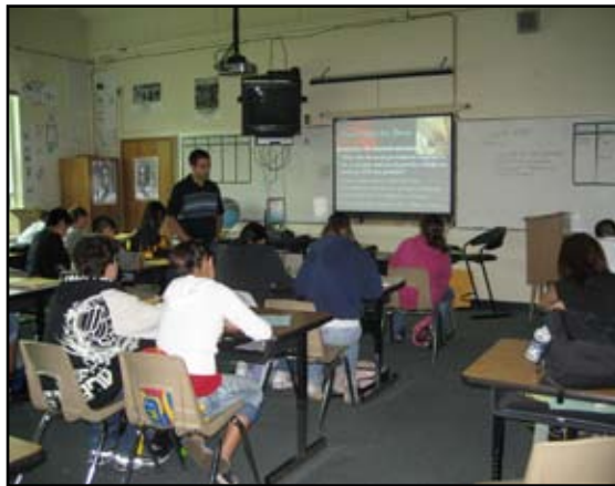
Above: Highline Middle School students being introduced to the lesson.

The students were asked to explore the impact of local government as Bellevue grew into a city by studying ten original source documents from