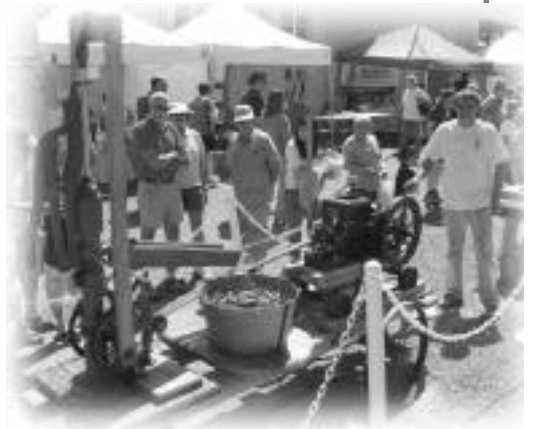
"What is it?"