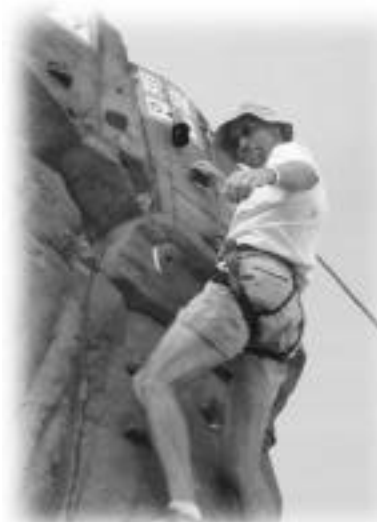
Aspiring to greater heights