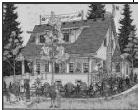
"Shortcake Makin's ~ McDowell House" Patti Simpson Ward ©2005

To order a greeting card, leave a message with Lyn Balint of EHC at 425.450.1049.