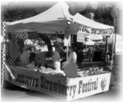
EHC Festival booth

For more Strawberry Festival information, including volunteer opportunities and Classic Auto Show registration, call 425.450.1046 or visit www.bellevuestrawberryfestival.org .