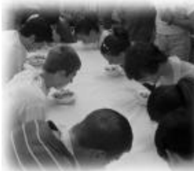
"Look, Mom! No hands!!!"