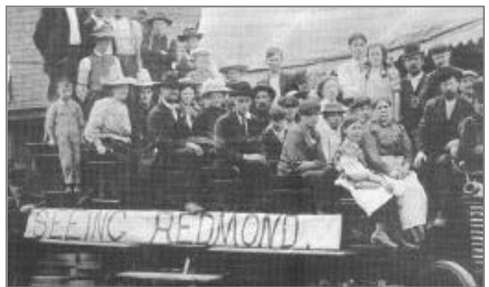
Redmond, Washington race track bus and early stage took tours to Snoqualmie Falls. (c. 1904)

(NOTE ~ TAX & SHIPPING ARE CHARGED ON ALL ORDERS.)