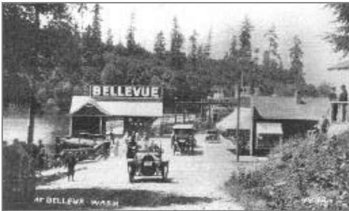
Bellevue, Washington ferry dock on Meydenbauer Bay (c. 1910)

Now available! Historic images depicting life on the Eastside from the EHC collection ~ perfect for sending or framing!