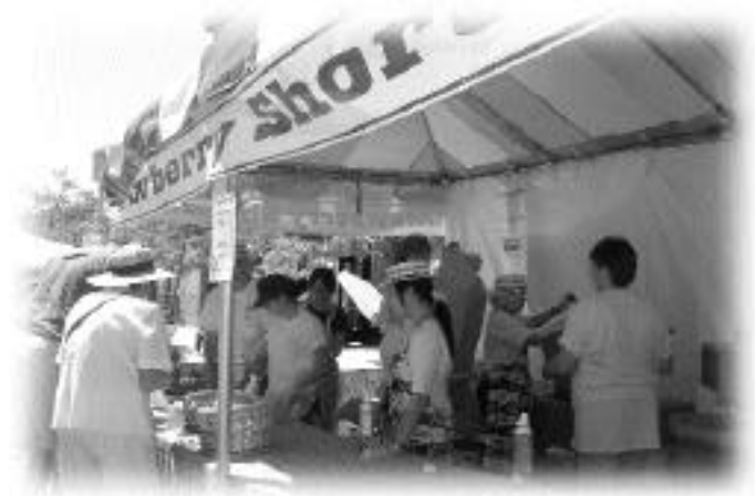
Fair-goers enjoying the signature strawberry shortcake.