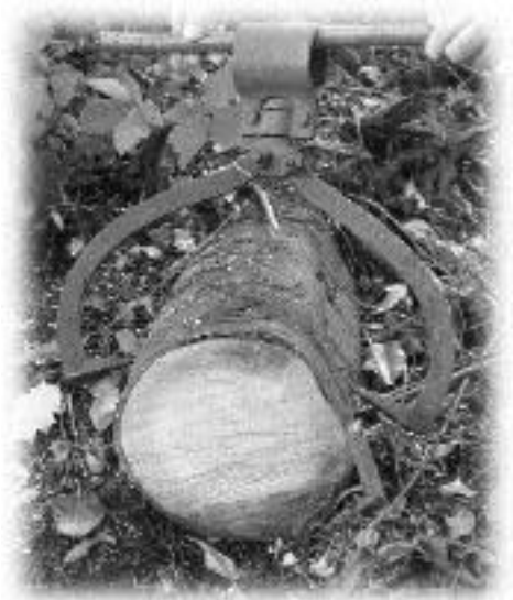
Lug hooks like this were used to carry timber

The 1924 Seattle Hardware Catalog calls this tool type the No. 119, and has this description: "This tool is designed especially