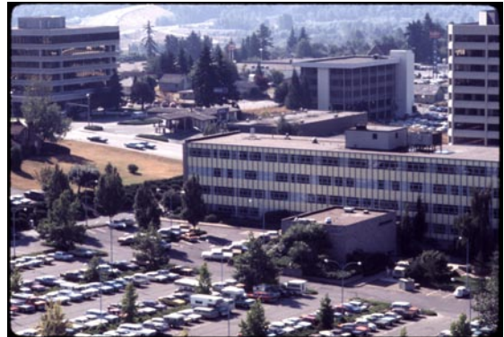
Puget Power Building on NE 4 th Street, circa 1969.

Bellevue as a major center for business. By the 1970s the Puget Power building (built in 1956) and a few modest office buildings on 108 th Avenue were the centers of business. Then came the "Boeing Bust," and Seattle residents looked east across the lake for work. The Paccar Building (built in 1967), followed by several taller buildings along 108 th gave downtown Bellevue a skyline by the mid-1980s. At around the same time, large office complexes started sprouting along Interstate 90, from Factoria to Eastgate. By 2000 Bellevue had more jobs than residents, ending its status as a bedroom community. Microsoft has become the city's largest employer, having absorbed a large part of the new downtown office space built during the 2000s.