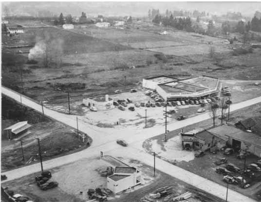
Bellevue Way & NE 8 th Street, looking south-east, 1937 & 2007.

All of this development would not be nearly as interesting if it were not for the remarkable people who have chosen to make Bellevue their home. Back when Seattle itself was a rough place, hardy pioneers cleared the land. Japanese farmers settled much of the area, providing the strawberries for the first Strawberry Festival. The WWII veterans who drove the first wave of growth have been replaced by the Microsoft workforce that comes from all over the world: according to the U.S. Census Bureau, one third of Bellevue's population was born outside the United States. In 140 years Bellevue has