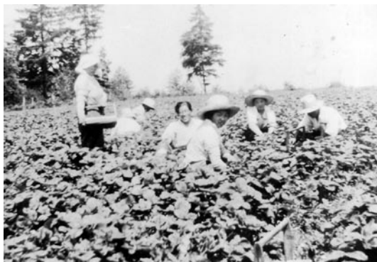
Takeshita Strawberry Farm near Lake Bellevue, 1930s.

By 1900 the greater Bellevue area had about 400 full-time residents. The trappings of civilization began to arrive, with phone service reaching the Eastside by 1907 and mercantile stores opening in Medina and Bellevue. The major change came in 1913 when car ferry service aboard the Leschi began. Trips left the Leschi dock in Seattle every 15 minutes and stopped at Medina and Meydenbauer Bay.