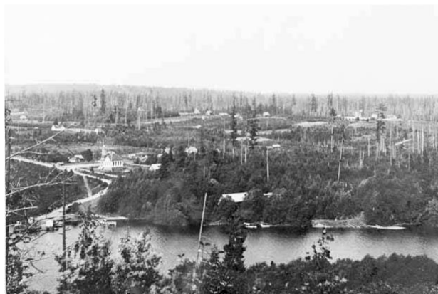
Meydenbauer Bay, Bellevue, circa 1910.

In the 1870s and 1880s more settlers trickled over. Most of the area was logged off during this period, leaving open areas that became orchards, vegetable patches and berry farms. Fast-growing Seattle needed a regular supply of fresh produce, and Bellevue provided it. Regular ferry service began in the 1880s, linking Eastside communities with markets in Seattle through Leschi and Madison Park. Most of the farmers had families, and Bellevue's first school opened in 1883 in a log cabin in the Enatai area.