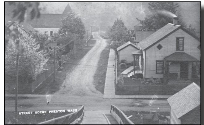
Above: Preston Street Scene, 1912. L78.051.029.

Nokomis Club Collection: Six boxes of documents covering the history of the Redmond women's club that founded the Redmond Library.