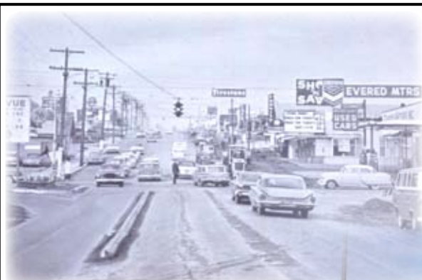
Bellevue Way and Main Street, looking North, 1965 and 2011.

Eastside Heritage Center P.O. Box 40535 Phone: 425-450-1049 Bellevue, WA 98015 Fax: 425-450-1050 www.EastsideHeritageCenter.org