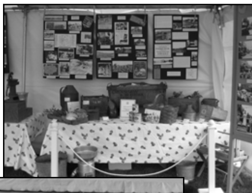
Right: Mini Museum Exhibit '07 Strawberry Festival