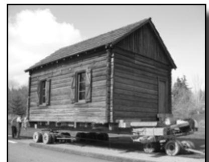
Fraser Cabin on wheels. April 4, 2008

This spring, some of Bellevue's oldest history was on the move. The 1888 Fraser Cabin at Kelsey Creek Farm Park was moved from its site of over 30 years as part of the City of Bellevue's Kelsey Creek Stream Restoration Project. The cabin is now in a much more suitable environment - out of the wetland and up on the hill, next to the Duey Barns.