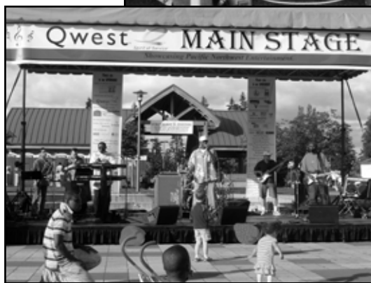
Left: Qwest Main Stage '07 Strawberry Festival