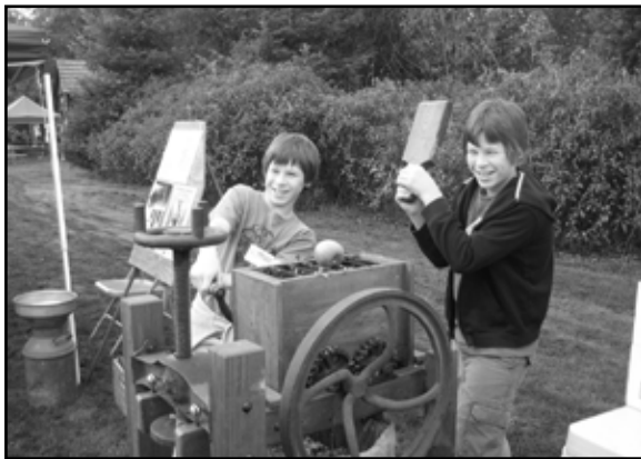
Above: Cider Press activity at the Fraser Cabin