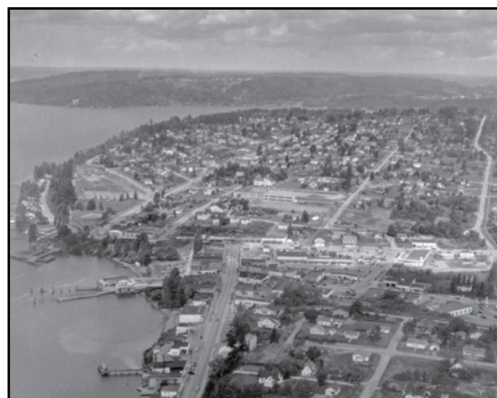
Above: Central Kirkland, ca. 1940. L90.18.3