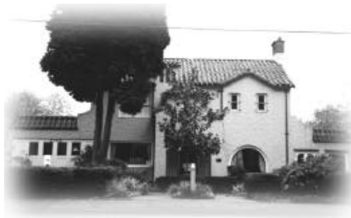
The Beautiful, Historic Winter's House on Bellevue Way

Join us for some holiday cheer as we decorate the Winters House for the season! There will be cookies, candy and refreshments for all participants to enjoy. Please note the new date and time for this annual EHC tradition.