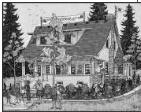
"Makin' Shortcake at the McDowell House" Patti Simpson Ward ©2005

To order greeting cards, leave a message with Lyn Balint of EHC at 425.450.1049.