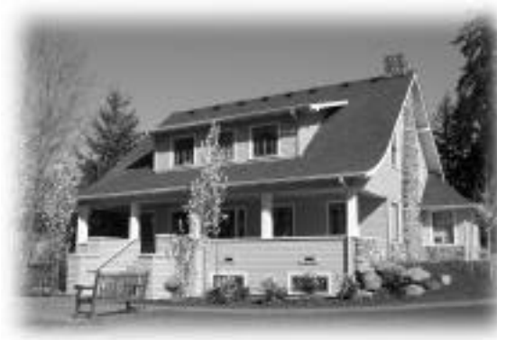
The Historic John H. McDowell House

Approaching the house, the visitor pictures easily how commandingly it graced its property when the McDowells built it, when its surroundings were less urban and the grounds were planted in fruit trees, berries and grapes. It sits looking out above a low bluff, and to the west towards the city, and even today seems sheltered from the bustle of the busy roads and railway below it. The boxy shape of the house with dormers signals its Craftsman influences. The massive gray river