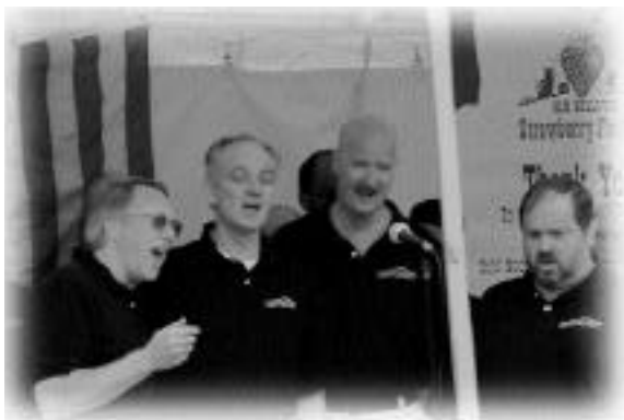
Musical Entertainment by Northwest Sound